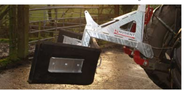
Robust spring loaded trip mechanism.