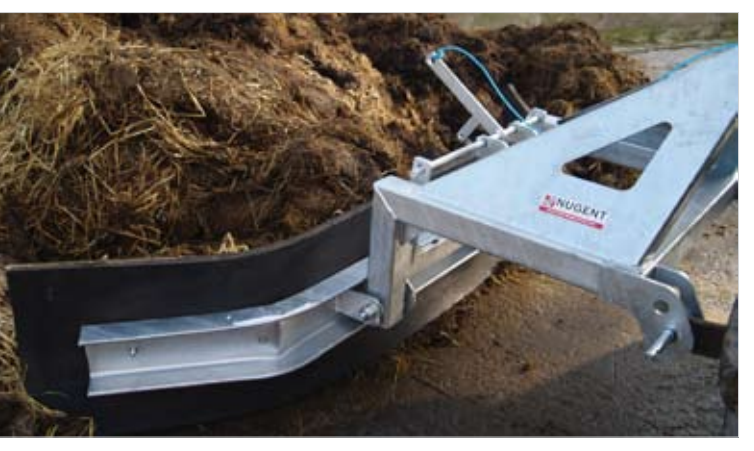
Durable construction designed to last.